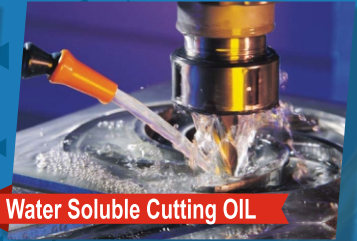
Water Soluble Cutting Oil