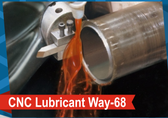
CNC Lubricant Way-68